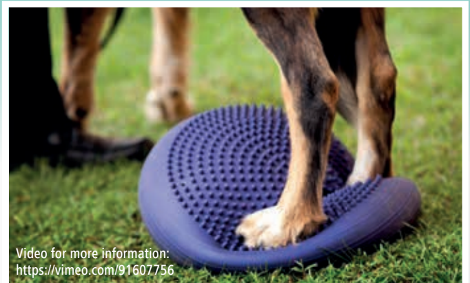
Video for more information: https://vimeo.com/91607756

Do you want to specialize in rehab and physical therapy and get your training from the worlds' leading specialists? Get started any time with your e-learning part and join us for the presence days to focus on labs and interactive case work ups.